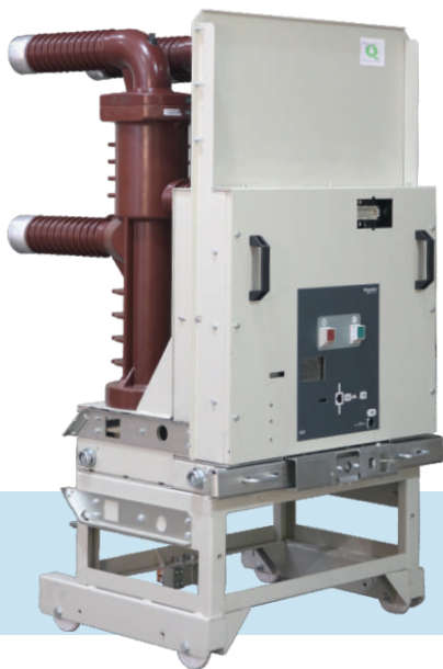
■ Schneider HVX EvoPacT HVX-O Vacuum circuit breaker