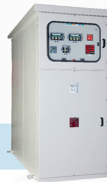
With Outer Door Closed