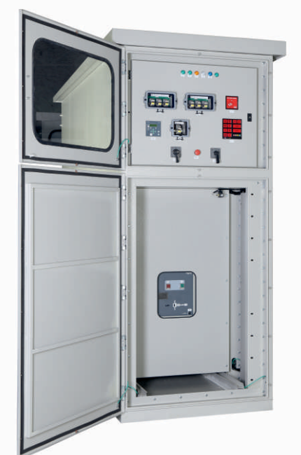
With Outer Door Open